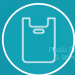
Any Plastic Shopping Bag with Handles

From 1 July 2022 , it is illegal to supply: