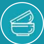
Disposable Plastic Bowls (without lids)