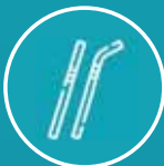
Disposable Plastic Straws & Stirrers