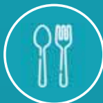
Disposable Plastic Cutlery