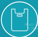
Any Plastic Shopping Bag with Handles

From 1 July 2022 , it is illegal to supply: