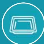
Disposable Plastic Food Containers (without lids)