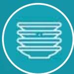
Disposable Plastic Plates