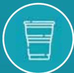
Disposable Plastic Cups for Cold Drinks*