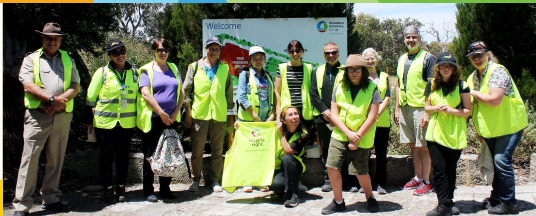
The City of Wanneroo and City of Vincent Residents Tour

Watch this video to see what happens when a battery ignites: tinyurl.com/msvz95y8