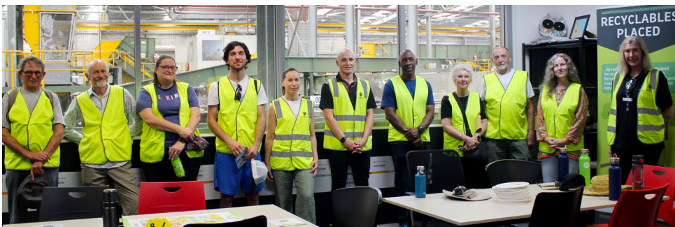
The City of Fremantle and Town of East Fremantle Residents Tour at the Education Centre overlooking the Material Recovery Facility

To recycle right here in WA, stick to these 5 materials only in your kerbside recycling bin: