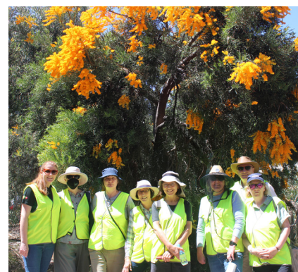
EMRC Residents Tour by a Moodja, or Native West Australian Christmas Tree in the Banksia Woodland Conservation Area

Across these tours, 53 people came along to connect with others, learn more about waste and recycling, and see first-hand how kerbside food organics and garden organics (FOGO) and recycling are received and sorted on-site. Luke and Bron also filmed a series of short livestreams on Instagram to highlight recycling achievements, while addressing some of the most common contaminants posing risks to staff and community safety, operational efficiency and the quality or recovered materials.