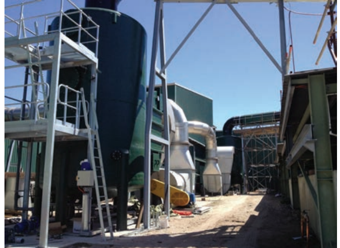
Humidifiers 5 & 6 completed with scaffolding in place for acoustic lagging repairs.

The bin storage area is now connected to the main tipping building's negative air pressure system thus ensuring an odour tight storage area for bins containing residual non-compostable waste prior to being taken off site for disposal.