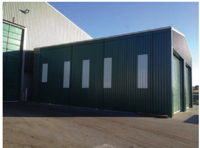
Completed fully enclosed storage shed with ducting to negative air pressure regime