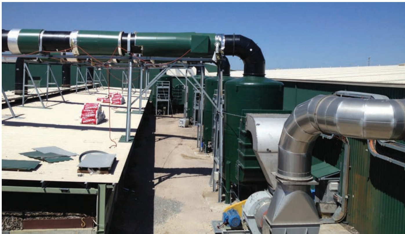
Humidifiers 1-4 complete and acoustic lagging repairs underway.